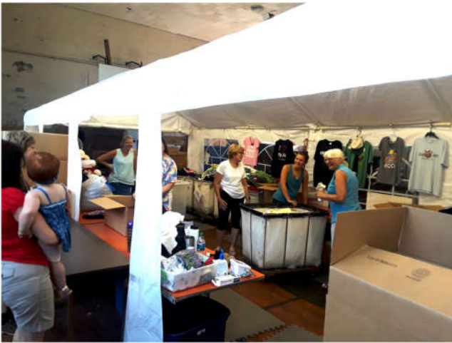
Tuesday AM Ladies Packing Party